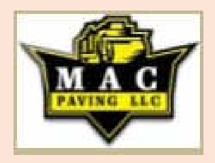
P O Box 94