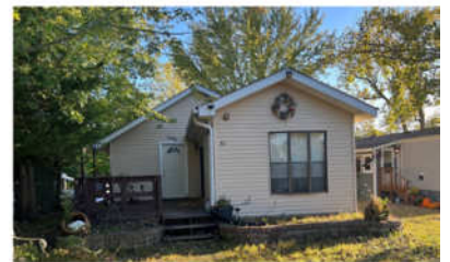
81 Lakeshore Dr $90,000