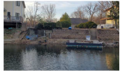
31 Largemouth Ln $65,000