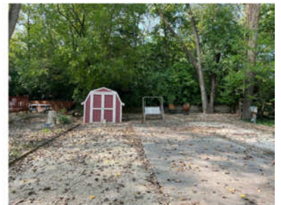
43 Birch Lane $40,000